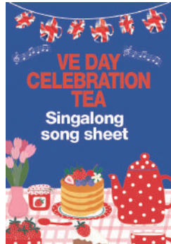
VE DAY SONGBOOK